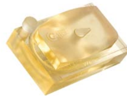
*See Objet Hearing Aid brochure